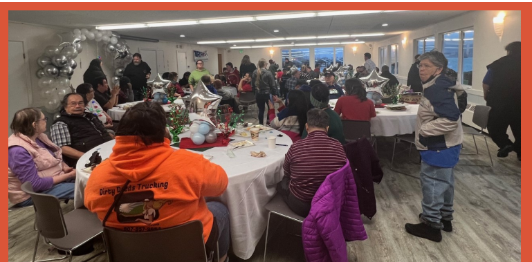
A fun photo from our annual Holiday Party